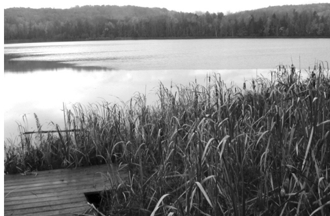
Outlook Dock Overseeing Lake Evangeline on Wildwood Harbor Preserve.

On December 30th, the Walloon Lake Association and Conservancy (WLAC) expanded its historic Wildwood Harbor Preserve. This expansion adds 30.5 acres, and continues the tradition of neighbors joining together to protect the Walloon Lake Watershed. The original preserve was established in 1998 with the help of nearly 80 friends and neighbors. The new acquisition was added with the generosity of current neighbors and original donors.