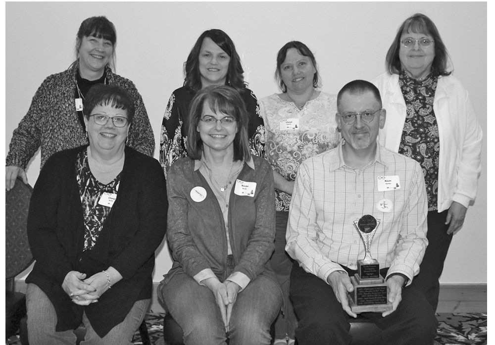
The Finance and Information Technology Teams received the highest Team Achievement Award.