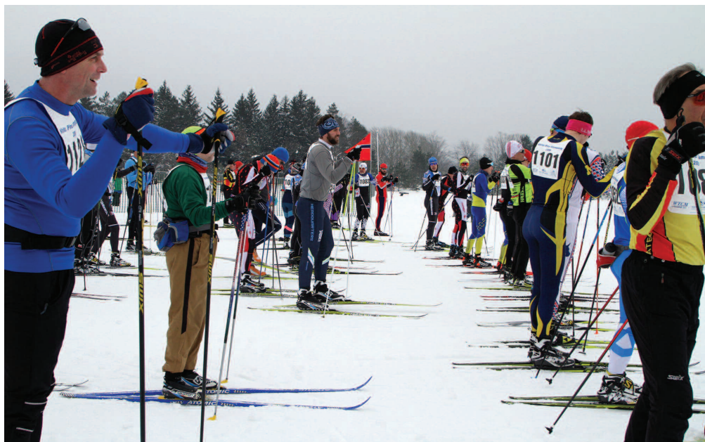
Michigan's longest-running point-to-point cross-country ski race, and continuing a tradition that began in 1977, the 44th Annual White Pine Stampede takes place on Saturday, February 1.